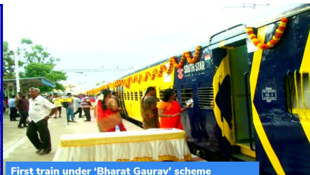
First train under 'Bharat Gaurav' scheme