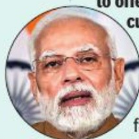
PM Narendra Modi