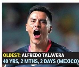
OLDEST: ALFREDO TALAVERA 40 YRS, 2 MTHS, 2 DAYS (MEXICO)