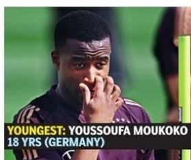
YOUNGEST: YOUSOUFA MOUKOKO 18 YRS (GERMANY)