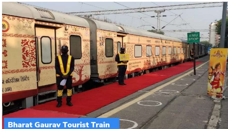
Bharat Gaurav Tourist Train