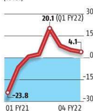
Quarterly GDP growth (% YoY)