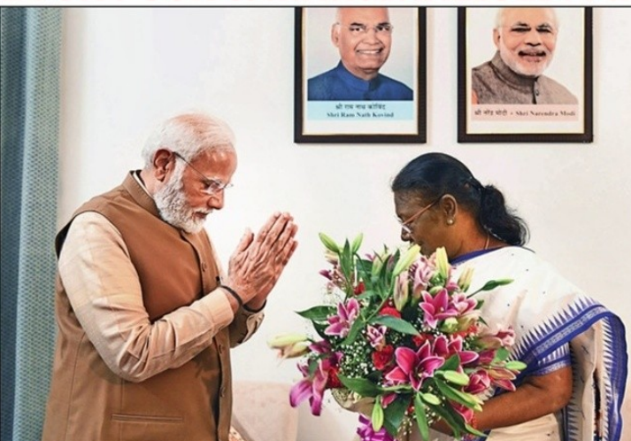
PM Modi congratulates Droupadi Murmu on being elected 15th President of India

“At a time when 1.3 billion Indians are marking Azadi Ka Amrit Mahotsav, a daughter hailing from a tribal community born in a remote part of eastern India has been elected our President! Smt Droupadi Murmu Ji's life, her early struggles, her rich service and exemplary success motivates each and every Indian. She has emerged as a ray of hope for our citizens, especially the poor, marginalised and the downtrodden