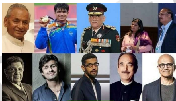
Padma Vibhushan (4)