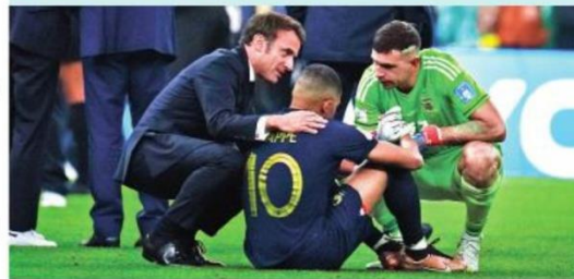
French president Emmanuel Macron and Argentine goalkeeper Emiliano Martinez comfort France's Kylian Mbappe