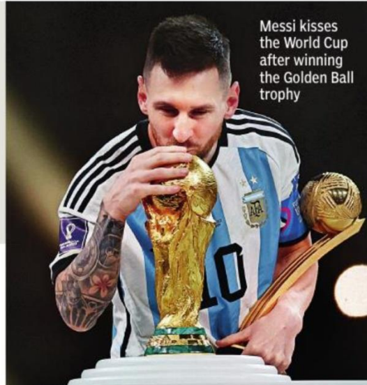
Messi kisses the World Cup after winning the Golden Ball trophy

44 year-old Lionel Scaloni is the youngest coach to win the World Cup since his compatriot Cesar Luis Menotti in 1978 (39)