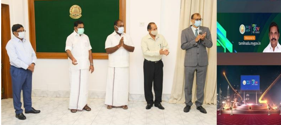
மாண்புமிகு தமிழ்நாடு முதலமைச்சர் திரு. எடப்பாடி K. பாலிசுவாமி ஆலாசன் 28.10.2020 அன்று தலைமைச் செயலகத்தில், தகவல் தொழில்நுட்பவியல் துறையின் கீழ் செயல்படும், தமிழ்நாடு மின்னளவுமை ஆணையகத்தால், மக்கள் அரசை எளிதில் தொடர்பு கொண்டு தங்கள் கருத்துகளைப் பகிர்ந்து கொள்ள உதவும் வகையில் உருவாக்கப்பட்ட இன்ற "நமது அரசு" ( http://tamilnadu.mygov.in ) வலைதளத்தை துவக்கி வைத்தார்கள்.