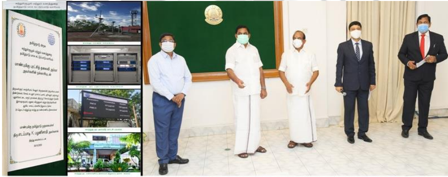
மாண்புமிகு தமிழ்நாடு முதலமைச்சர் திரு. எடப்பாடி K. பழனிசாமி அவர்கள் 28.10.2020 அன்று தலைமைச் செயலகத்தில், தமிழ்நாடு மாக கட்டுப்பாடு வாரியத்தின் மூலமாக தமிழ்நாட்டில் உள்ள 21 மாவட்டங்களில் நிறுவப்பட்டுள்ள 25 தொடர் கற்றுப்புற காற்றுத்தர கண்காணிப்பு நிலையங்களை (Continuous Ambient Air Quality Monitoring Stations) திறந்து வைத்தார்கள்.