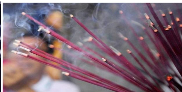
KVIC's Khadi Agarbatti Atmanirbhar Mission (KAAM) 2020