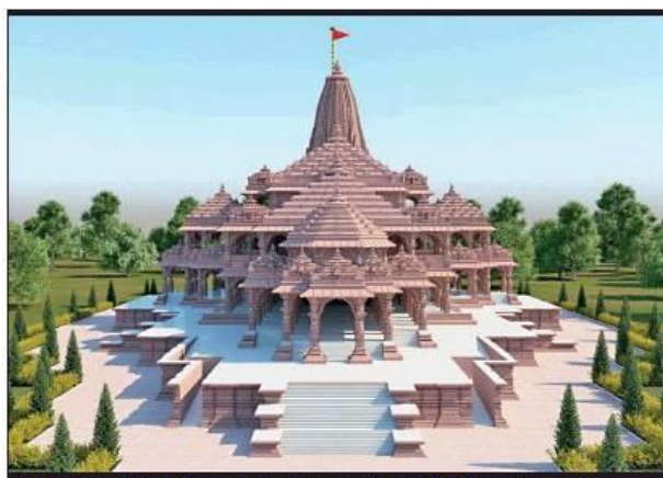
A picture of the proposed structure, released by the architects