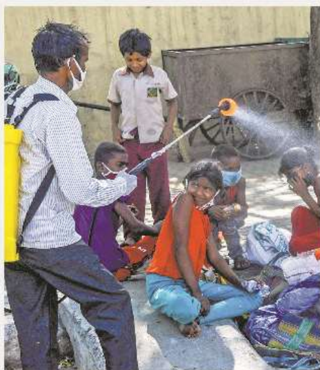
Sprayed on: Children, who came to Ghazipur Mandi in Delhi to collect leftover vegetables on Saturday, getting sprayed with sanitiser.

With 10,258 new COVID-19 cases recorded as on 10.30 p.m. on Saturday, India overtook Spain to become the fifth most-affected country. Between May 30 and June 5, India recorded 8,970 new cases every day on an average, the third-highest in the world