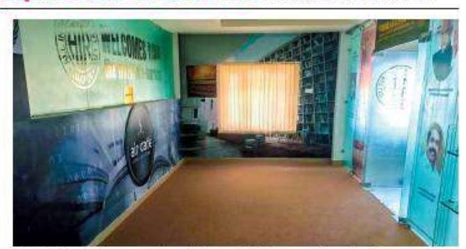
AIR Cafe under construction on SOEL premises in Taramani