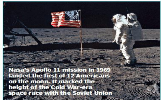
Nasa's Apollo 11 mission in 1969 landed the first of 12 Americans on the moon. It marked the height of the Cold War-era space race with the Soviet Union