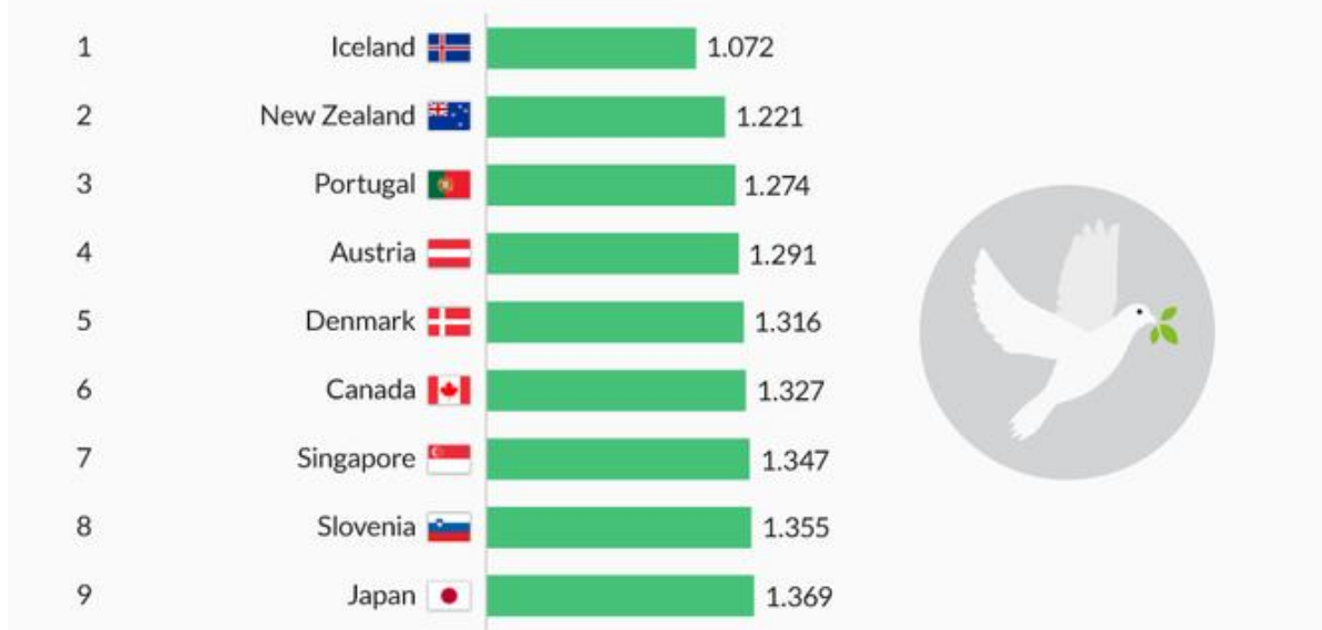
Countries ranked by state of peace in 2019 (1=most peaceful, 5=least peaceful)